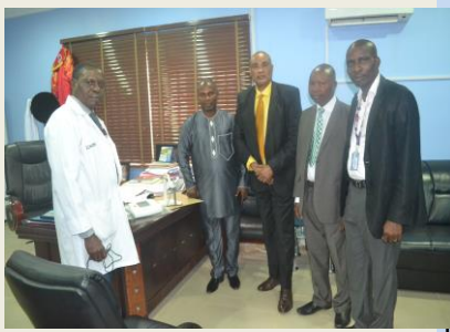
A group photograph with the CEO of Smorterc Nig. Ltd