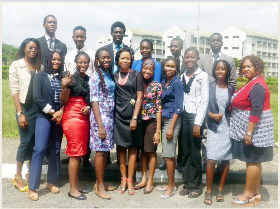
UNIMED debate team at Covenant University, Ota, Ogun State